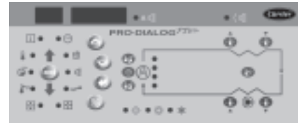
PRO-DIALOG Plus operator interface